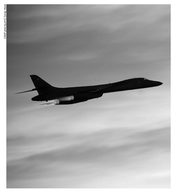
A B-1B Lancer on a training mission from Ellsworth AFB, S.D.